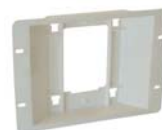
Filter Ready Adapter Connects to Septic Tank Wall