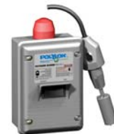
Outdoor SmartFilter® Alarm Polylok, Zabel & Best filters accept the SmartFilter® switch and alarm.